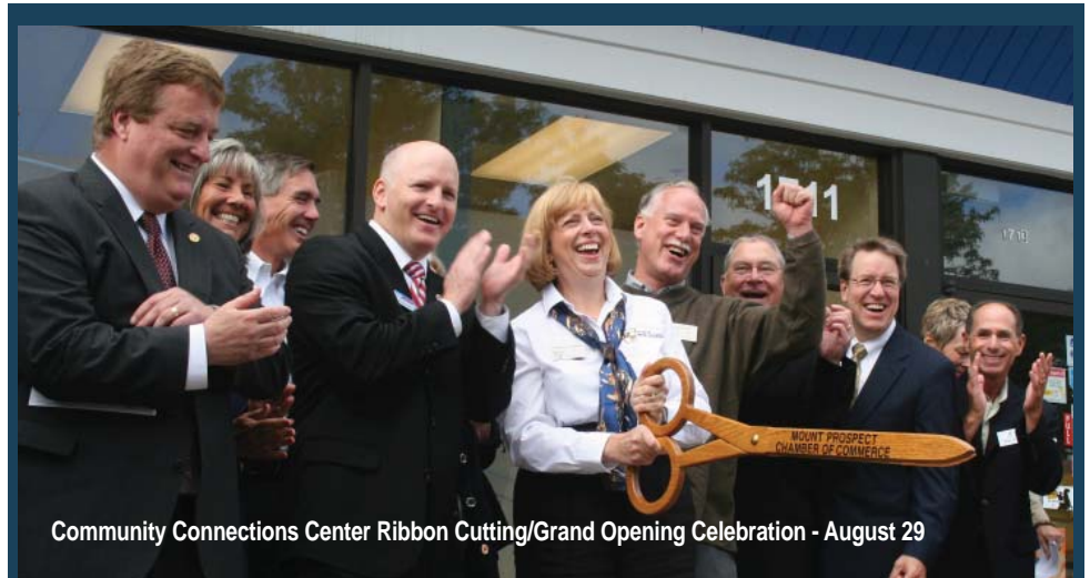
Community Connections Center Ribbon Cutting/Grand Opening Celebration - August 29