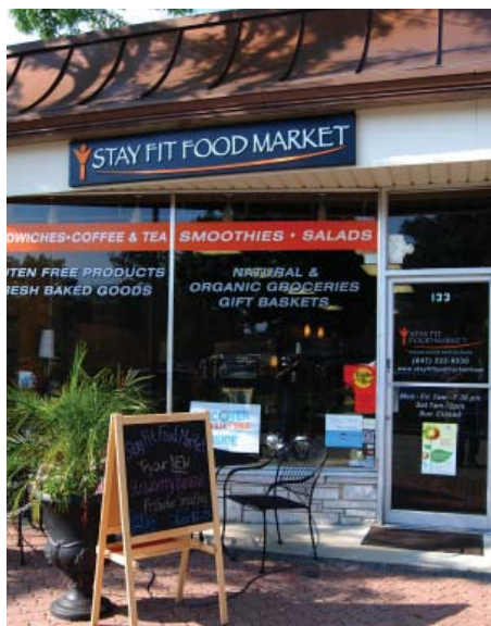
Stay Fit Food Market