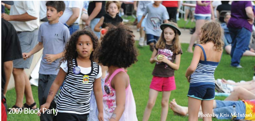
2009 Block Party