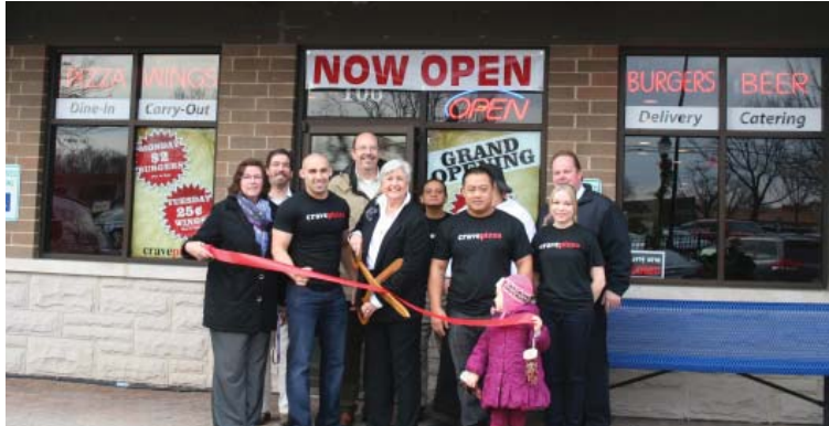
Crave Pizza 106 W Northwest Hwy., 224/735-3973 www.cravepizzanow.com