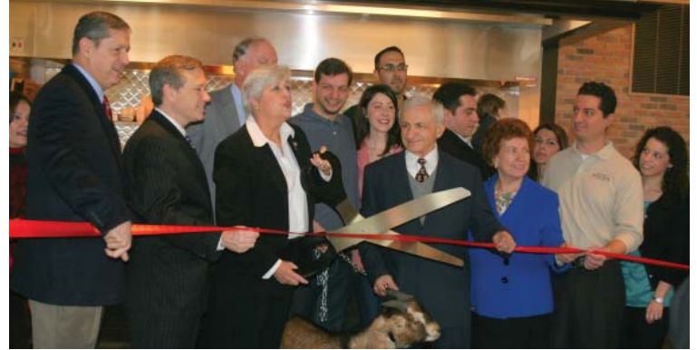
Billy Goat Tavern and Grill 164 Randhurst Village Dr., Randhurst Village, 847/870-0123 www.billygoattavern.com