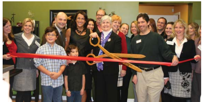
Stay Fit Physical Therapy and Core Wellness 6127 W. Prospect Avenue, 847/255-2348 www.stayfitpt.com/