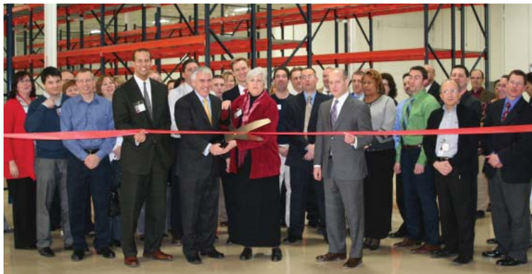
Fisher Clinical Services 699 North Wheeling Road, 847/768-8180 www.fisherclinicalservices.com