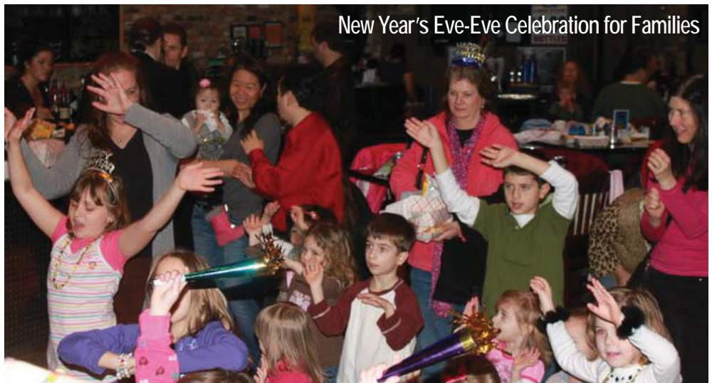
New Year's Eve-Eve Celebration for Families

December 30, Blues Bar New Year's Eve-Eve Celebration for Families - Back by Popular Demand. Brought to you by the Mount Prospect Downtown Merchants' Association. Last Year was sold out so we will again offer three seatings! Family Members of the Downtown Merchants Association will again be able to purchase tickets via advance pre-sale. Check the website for updates and family membership information, www.mpdma.com or like us on Facebook at www.facebook.com/mpdma for updates..