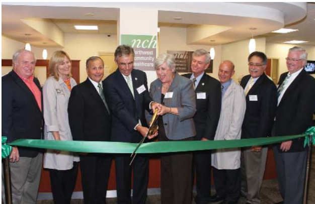
Northwest Community Healthcare Health Center 199 West Rand Road (847) 618-5400 www.nch.org