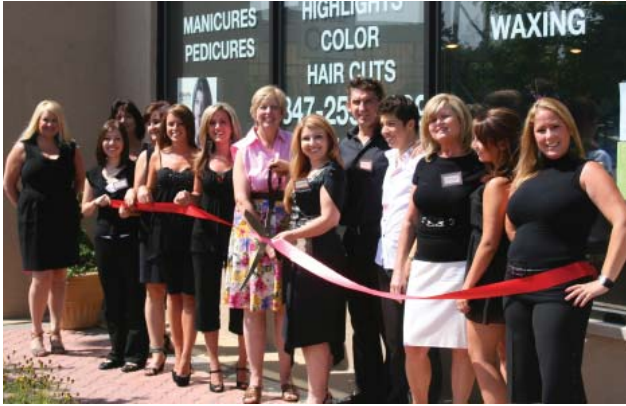
Jack Alexander Salon & Spa 416 W. Northwest Hwy. (847) 259-1199 www.jackalexandersalon.com