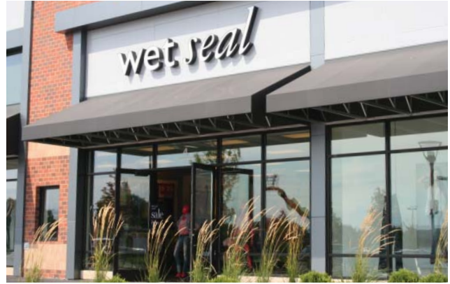
Wet Seal 4 Randhurst Village Drive (847) 870-7810 www.wetseal.com