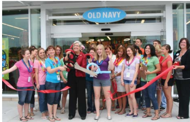
Old Navy Randhurst Village - 1015 N Elmhurst Rd. (847) 870-0373 www.oldnavy.com