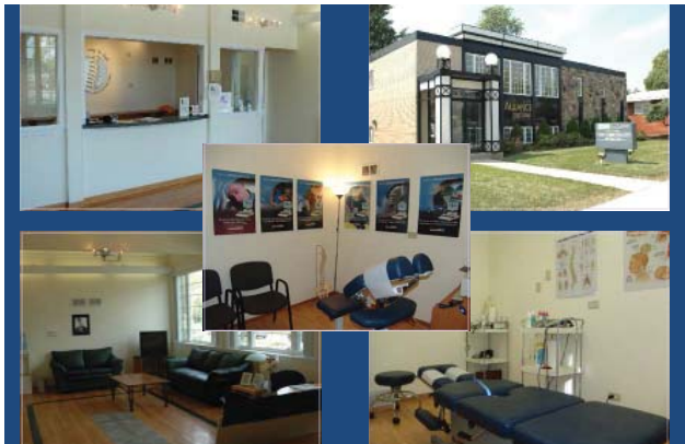
CLCW corp. Chiropractic Wellness Clinic 321 W. Prospect Ave. (847) 253-7600