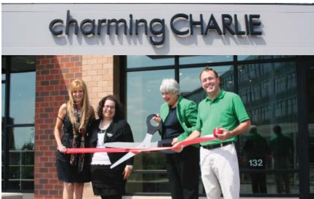
Charming Charlie 132 Randhurst Village Drive (847) 870-7217 www.charmingcharlie.com