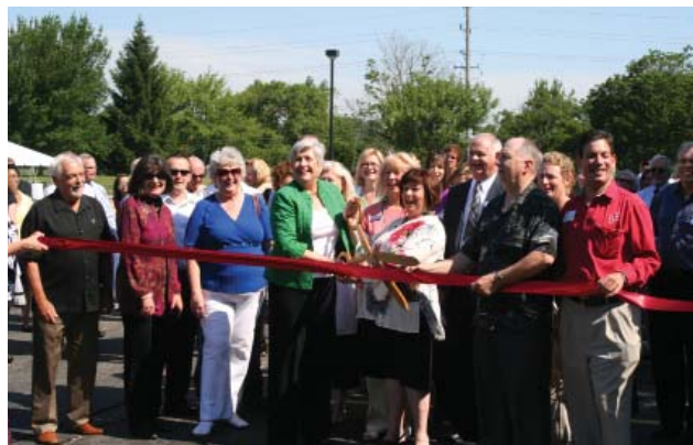
Rainbow Hospice 1550 Bishop Ct. (847) 888-70-RAINBOW www.rainbowhospice.com