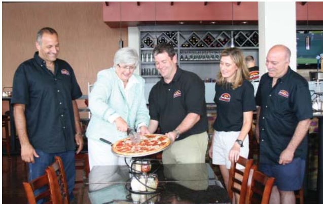
Tony Sacco's Coal Oven Pizza 182 Randhurst Village Drive (847) 253-4000 www.tonysaccos.com