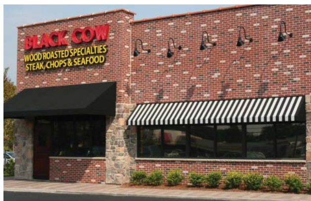
Black Cow Kitchen & Bar 912 S. Busse Rd. (847) 290-9000