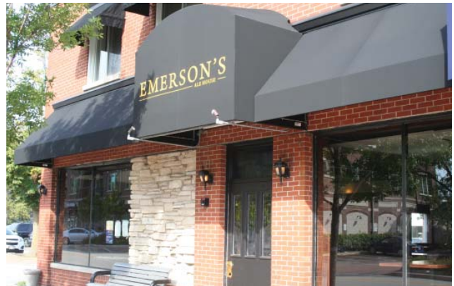
Emerson's Ale House 113 S. Emerson Street