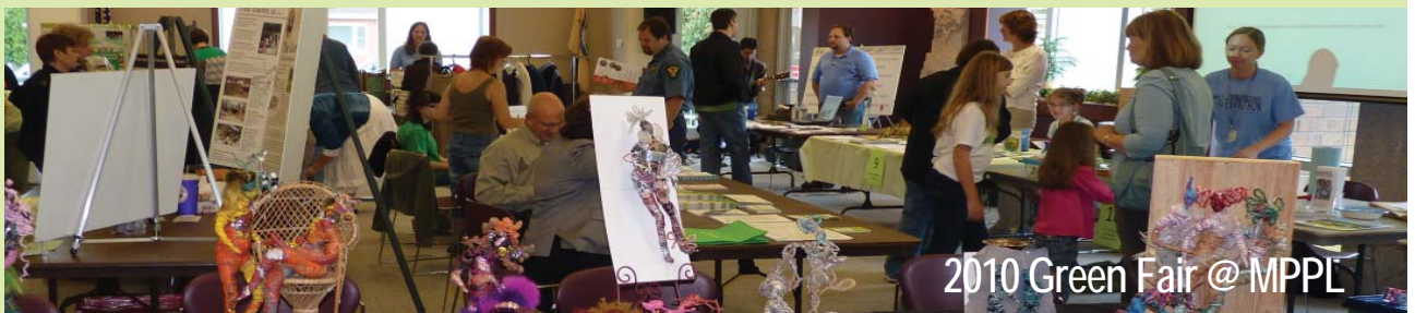
2010 Green Fair @ MPPL

It is important to note that without the funding provided by the Energy Efficiency and Conservation Block Grant, none of these programs and projects may have been possible.