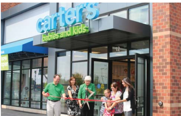
Carter's 12 Randhurst Village Drive (847) 870-0185 www.carters.com