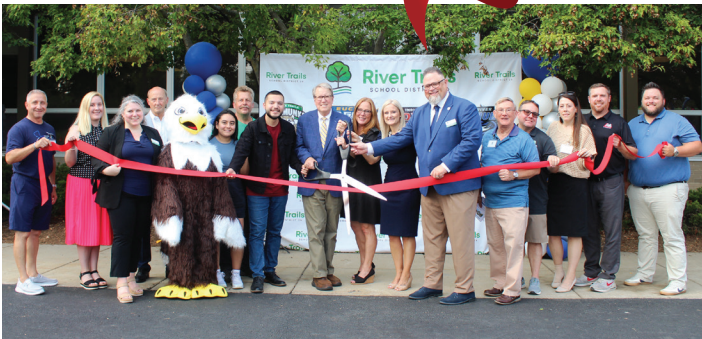
September 5, 2024 Euclid Elementary School Connections Field 711 E. Euclid Ave.