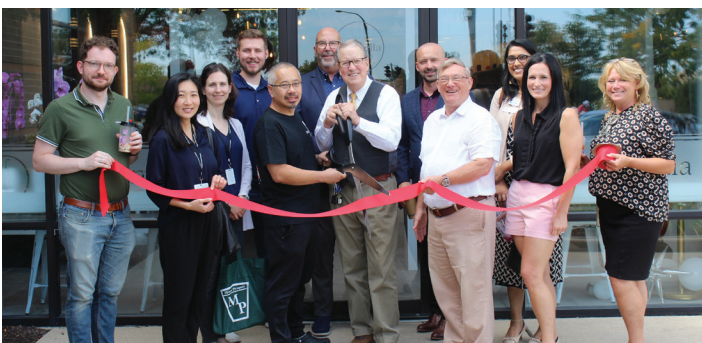
September 13, 2024 Umbrella Tea House | 1 W. Rand Rd., Ste E 224.735.7049 | umbrellateahouse.com