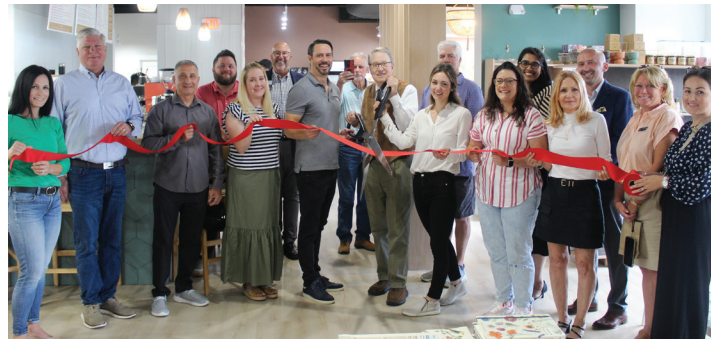
September 6, 2024 Khepri Café | 106 S. Emerson St. 224.857.8992 | khepricafe.com