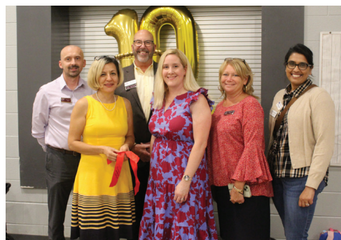
August 30, 2024 Busy Bees Montessori School | 400 E. Gregory St. 847.392.2233 | bb-montessori.com