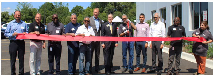
July 18, 2023 | AVERY DENNISON REFLECTIVE SOLUTIONS 902 Feehanville Drive | averydennison.com