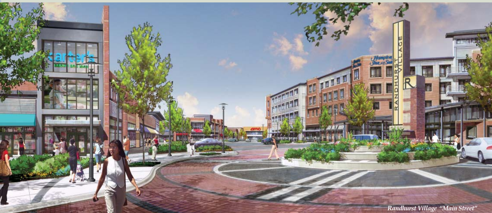
Randhurst Village "Main Street"