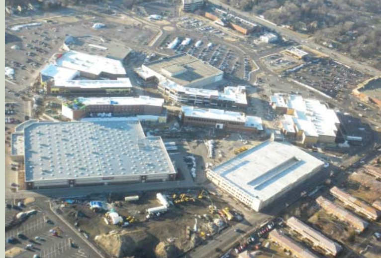
Aerial view of construction at Randhurst Village

Northwest Community Hospital – Northwest Community Hospital is currently building out their medical facility on Rand Road (former Twin Links property) and anticipate opening their doors late this summer. NWCH will provide a full range of medical care at the 20,000 square foot medical office building serving the entire community.