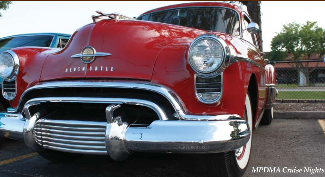
MPDMA Cruise Nights