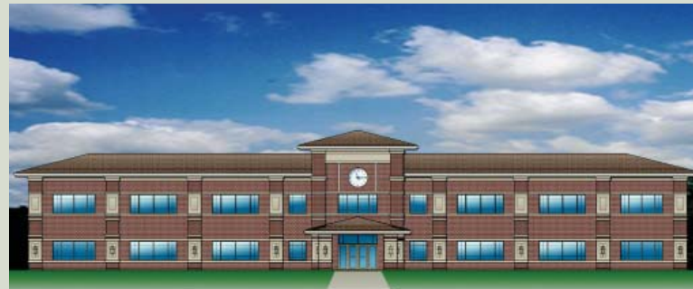
Northwest Community Hospital Facility - Salam Salahi, Architect