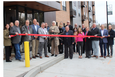
March 31, 2021 10 NORTH MAIN STREET APARTMENTS 10 North Main 847.254.1223 | 10northmainapartments.com