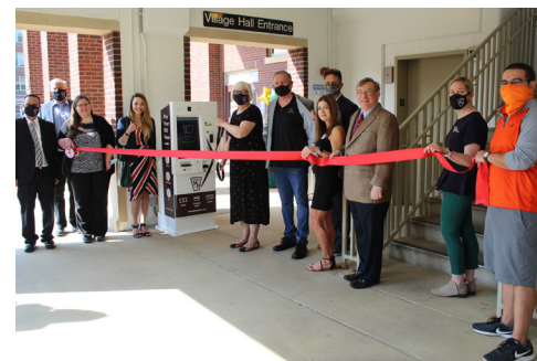
April 6, 2021 VILLAGE HALL PAYMENT KIOSK 50 South Emerson Street