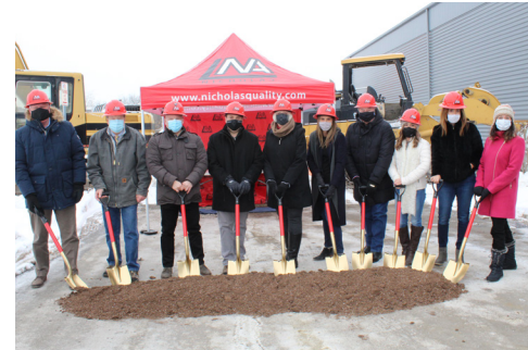
February 10, 2021 MOUNT PROSPECT ICE ARENA GROUND BREAKING Third Full Size Ice Rink 1501 Feehanville Drive 224.443.4370 | mp-ice.com