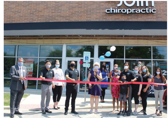
Tuesday | July 7, 2020 THE JOINT CHIROPRACTIC 104 West Rand Road (next to Potbelly's) 847.499.2360 | thejoint.com