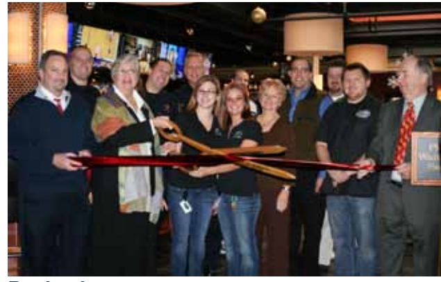
Bar Louie 200 E Rand Road 847/394-3456