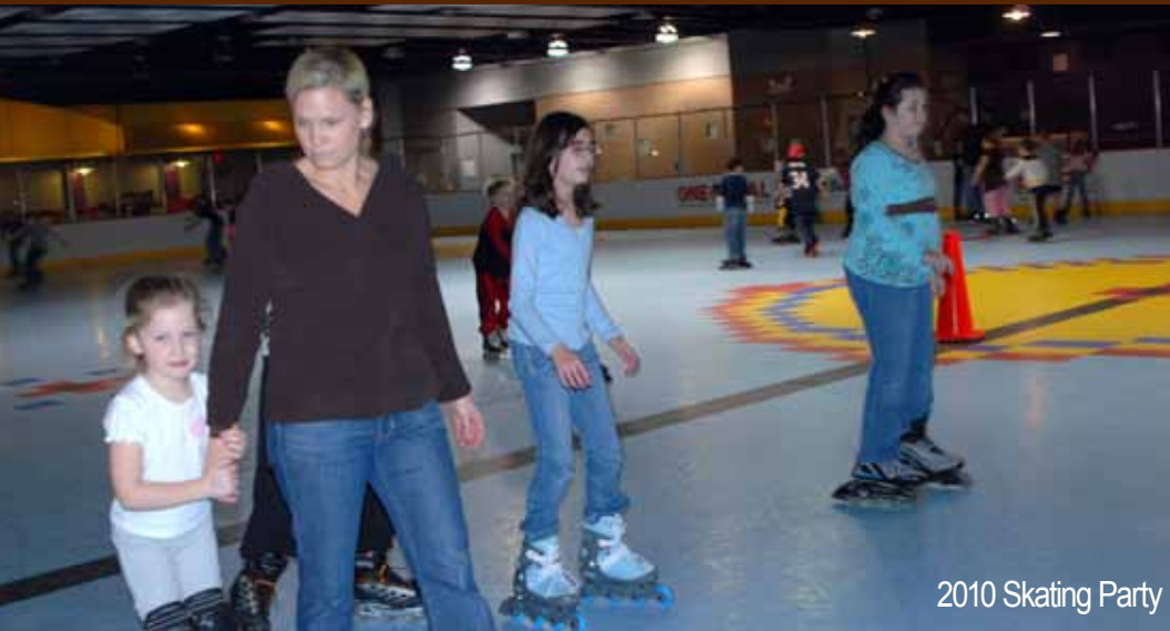
2010 Skating Party