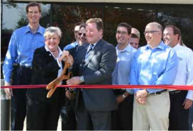
Corelink Data Center 800 E. Business Center Drive (312) 957-7409