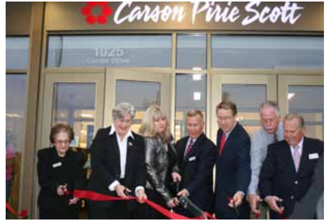
Carson Pirie Scott 999 N. Elmhurst Road 847/392-2000