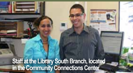
Staff at the Library South Branch, located in the Community Connections Center

For more information about these programs, please call the Center at 847/ 506-4930.