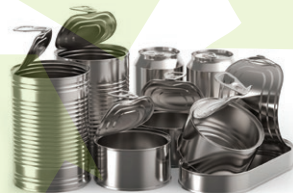
Aluminum Cans, Trays and Clean Foil