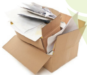
Cardboard and Paper