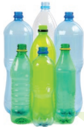
Plastic Containers (with #1-5, 7)

Recycle only these CLEAN items in your BLUE recycling cart: