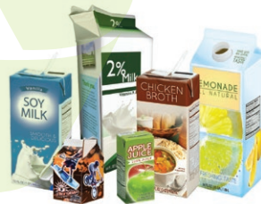
Milk and Juice Cartons

Do not use plastic bags for recyclables!